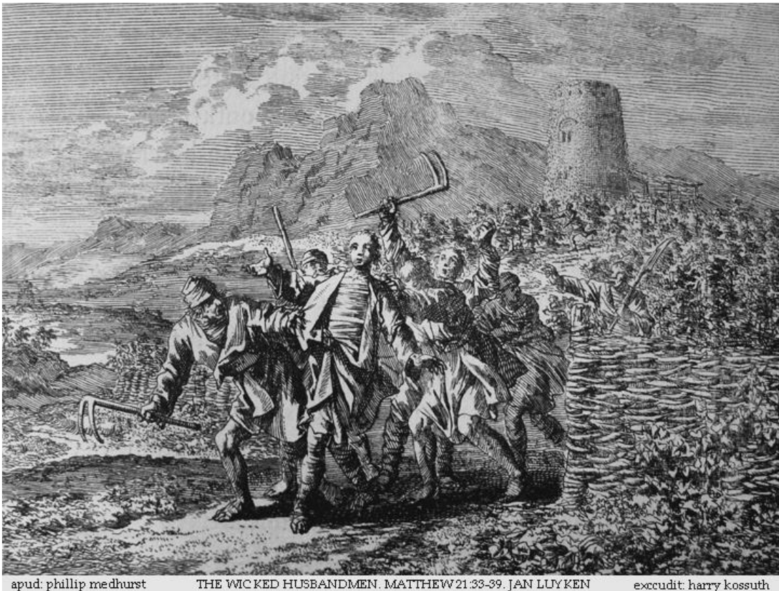
THE WICKED HUSBANDMEN. MATTHEW 21:33-39. JAN LUYKEN

18 th SUNDAY AFTER PENTECOST 8 th OCTOBER 2017