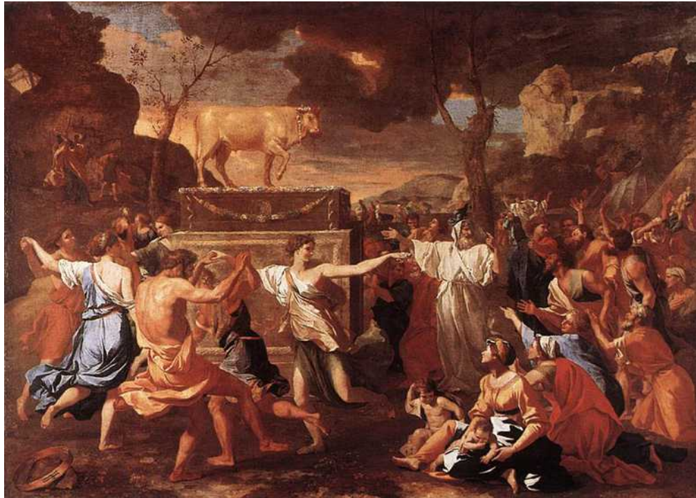
The Worship of the Golden Calf , Jacopo Tintoretto, c 1560.

Eighteenth Sunday after Pentecost 12 th October, 2014