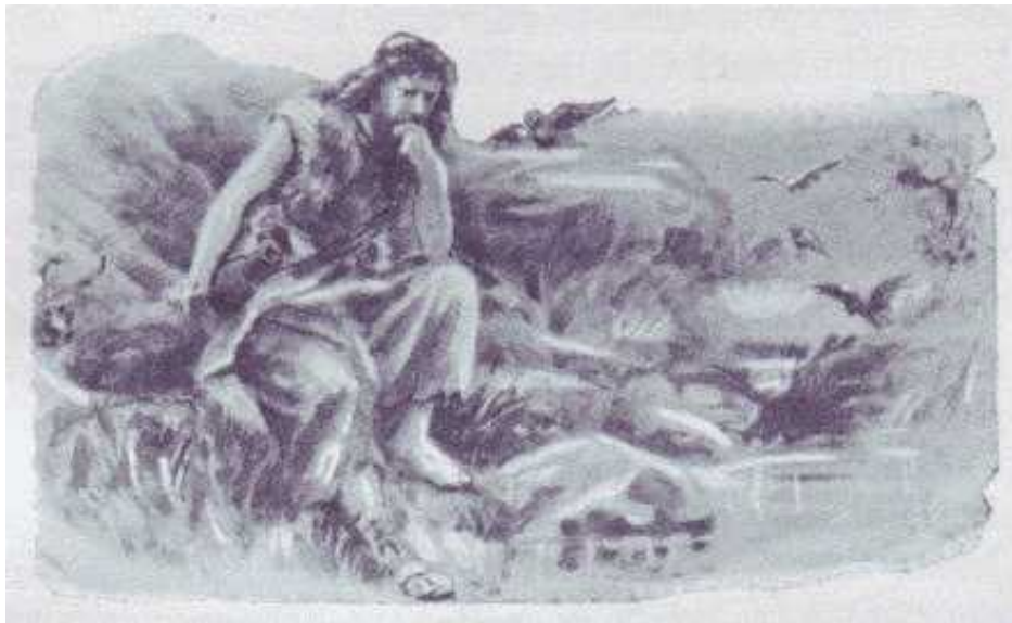
John The Baptist in the wilderness

Parish: parish@stgeorgeseastivanhoe.org Bulletin: rosalieprince@optusnet.com.au 9459 1554 Church Website: http://stgeorgeseastivanhoe.org