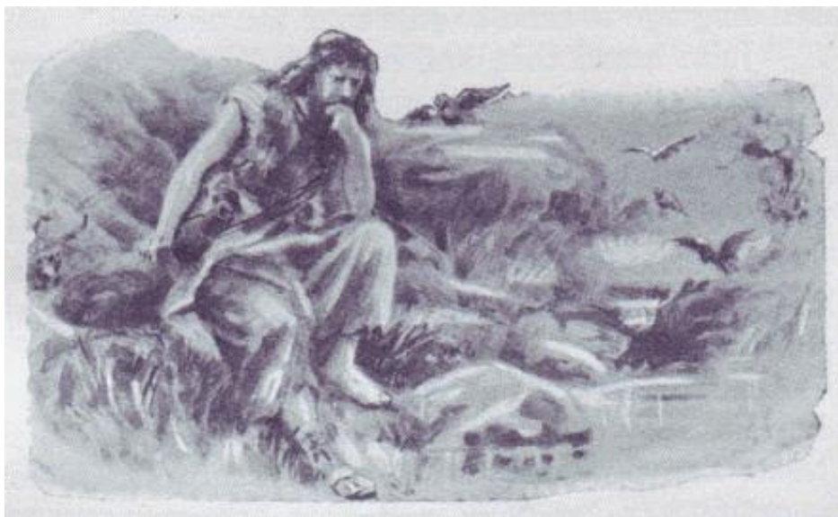
John The Baptist in the wilderness