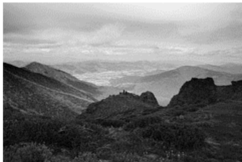
Looking down from Mt Bogong

God offers us the view from the mountaintop. It's a view formed in God's nature of love. When we know we are deeply loved and valued for whom we are, loving others becomes a more natural response. While our circumstances may not change, we find new ways of viewing them and new ways forward that are held in God's wisdom, forgiveness and love.