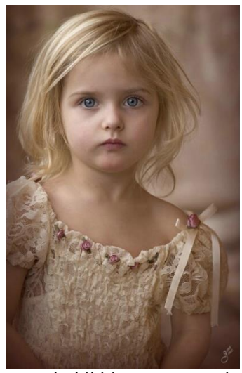
'Whoever welcomes one such child in my name welcomes me, and whoever welcomes me welcomes not me but the one who sent me.'