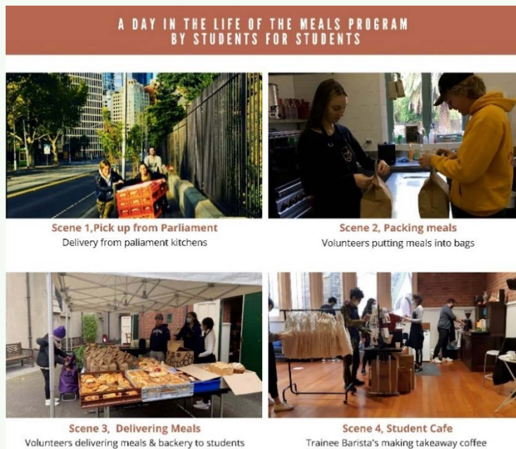
Scene 1, Pick up from Parliament Delivery from parliament kitchens