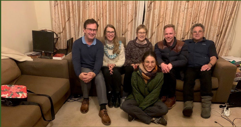
The Reconciliation team when they met together just before lockdown 5.0.