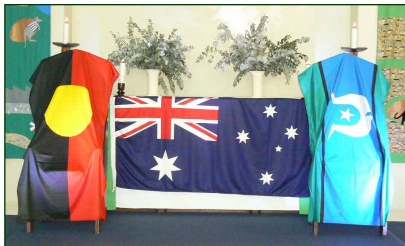
The high altar, with eucalyptus, is flanked by the Aboriginal and Torres Strait Island flags.